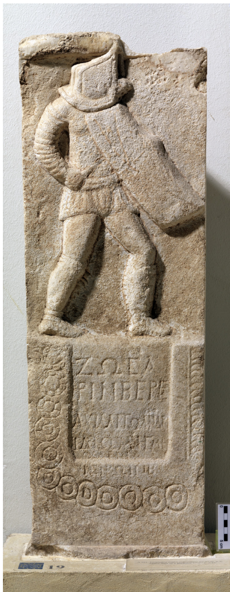
Fig. 1: The funerary stele of Achilles.