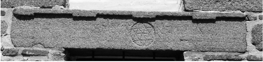
Fig. 1. No. 1: Acclamation of the Lord/Emmanouel on architrave block (Photo by the author).