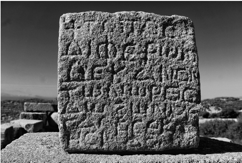
Fig. 3. No. 3: Epitaph of the gravediggers of Great Church.