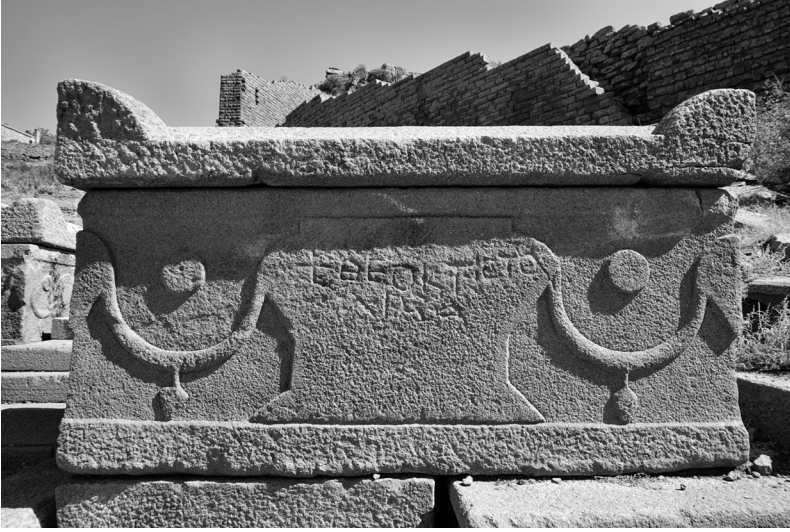
Fig. 5. No. 5: Sarcophagus of Theoktistos (Photo by the author).