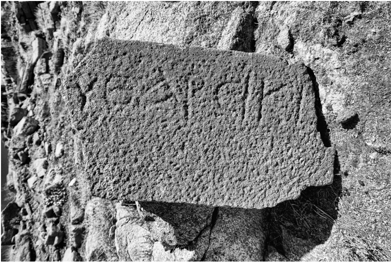
Fig. 11. No. 11: Fragment of Sarcophagus inscription.