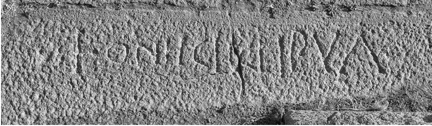
Fig. 8. No. 8: Sarcophagus inscription of Onesimos.