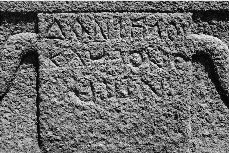
Fig. 4a. No. 4: Detail of the tabula ansata.