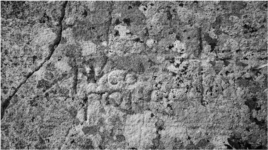
Fig. 2. No. 2: Inscription on the bedrock (Photo by the author).