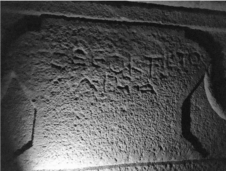
Fig. 5a. No. 5: detail.