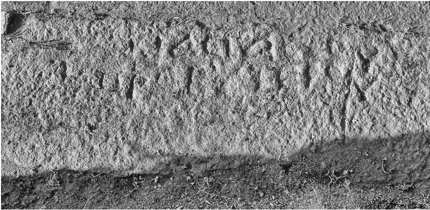
Fig. 9. No. 9: Sarcophagus inscription of Anastasios (Photo by the author).