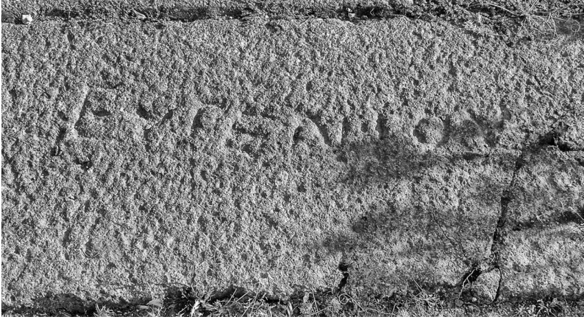
Fig. 10. No. 10: Sarcophagus inscription of Eugenios (Photo by the author).