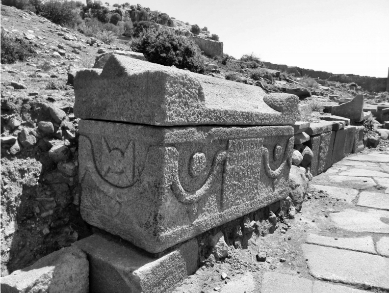
Fig. 4. No. 4: Sarcophagus of the heirs of Daniel.