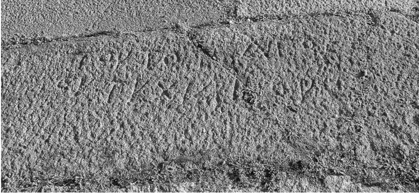
Fig. 7. No. 7: Sarcophagus inscription of Eutychianos.