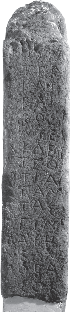
Fig. 1. Fifth-century law from Abdera ( I. Thrac. Aeg. E1; MA 5524). The copyright of the image belongs to the Greek Ministry of Culture and Sport; the monument is under the authority of the Greek Ministry of Culture and Sports/Ephorate of Antiquities of Xanthi.