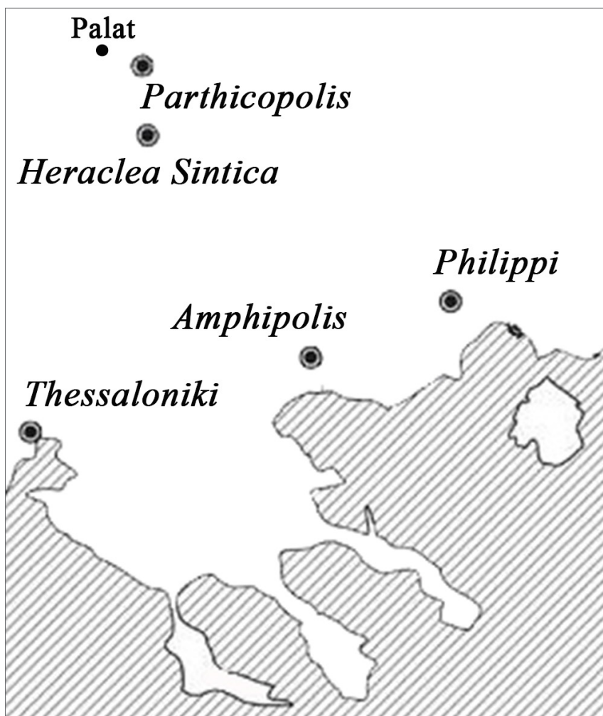
Fig. 2. Location of the ceramic medallion's findspot.