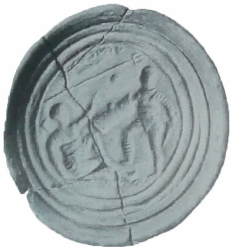
Fig. 4. Ceramic mold with gladiatorial scene from Savaria, Pannonia (after Alföldi 1938, no. 46, pl. LXVIII/2a).