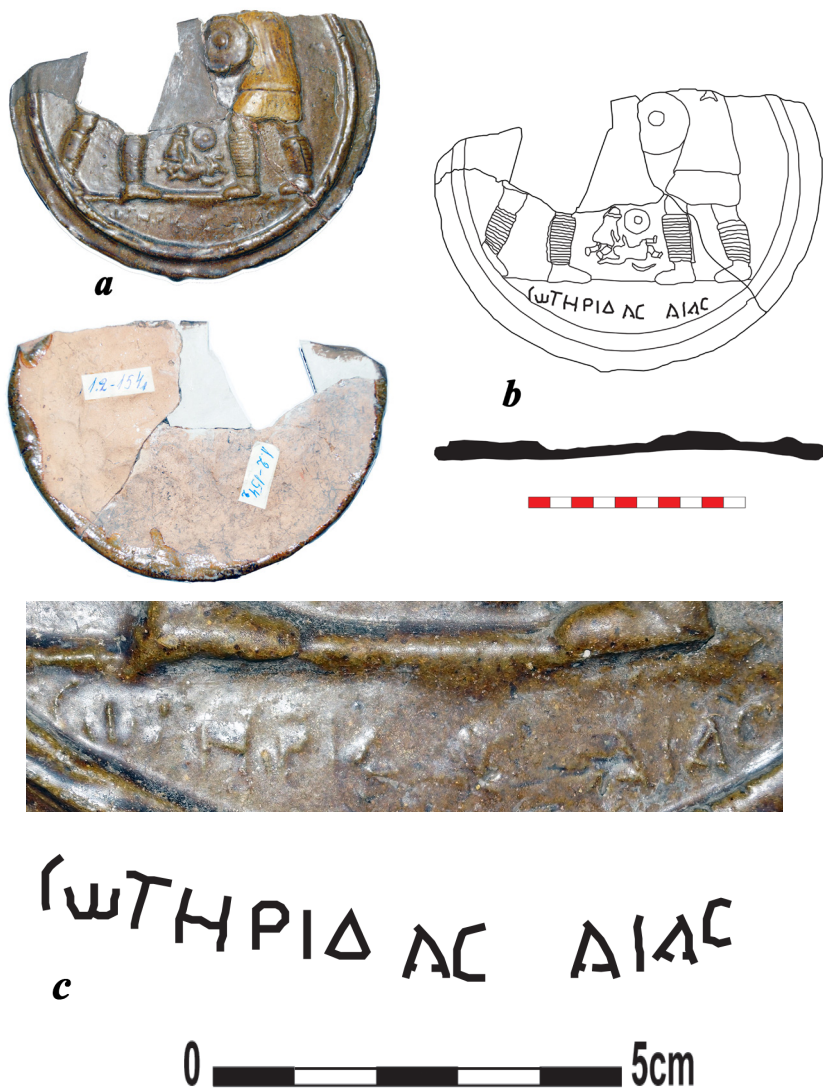
Fig. 1. Ceramic medallion from the village of Palat. Regional Museum of History-Blagoevgrad, inv. nos. 1.2.-154 1, 1.2.-154 2 : (a) obverse and reverse; (b) graphic reconstruction; (c) inscription.