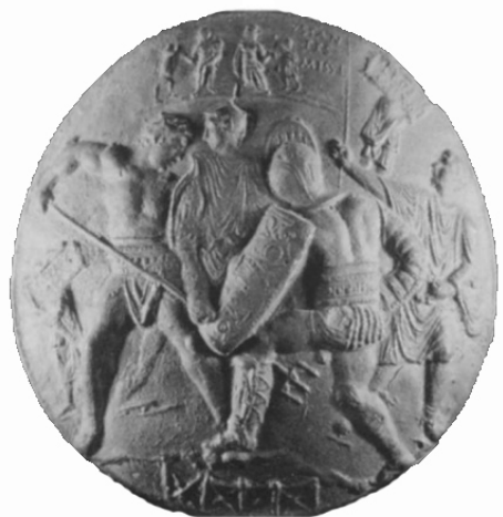
Fig. 5. Ceramic medallion with gladiatorial scene from Cavillargues, Gaul (after Wuilleumier, Audin 1952, no. 34, pl. II).