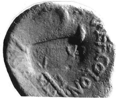
Αρ. 9 (μεγέθυνση)