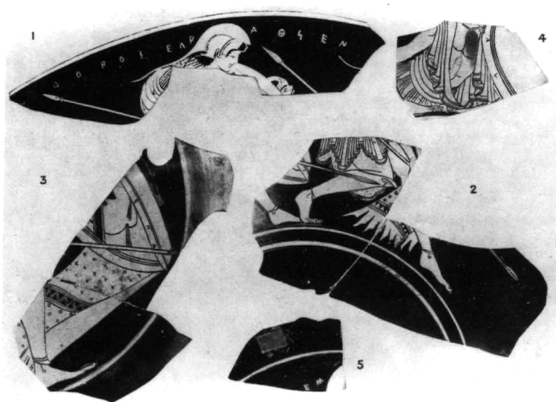
K. Görkay, Fig. 1. 1-5