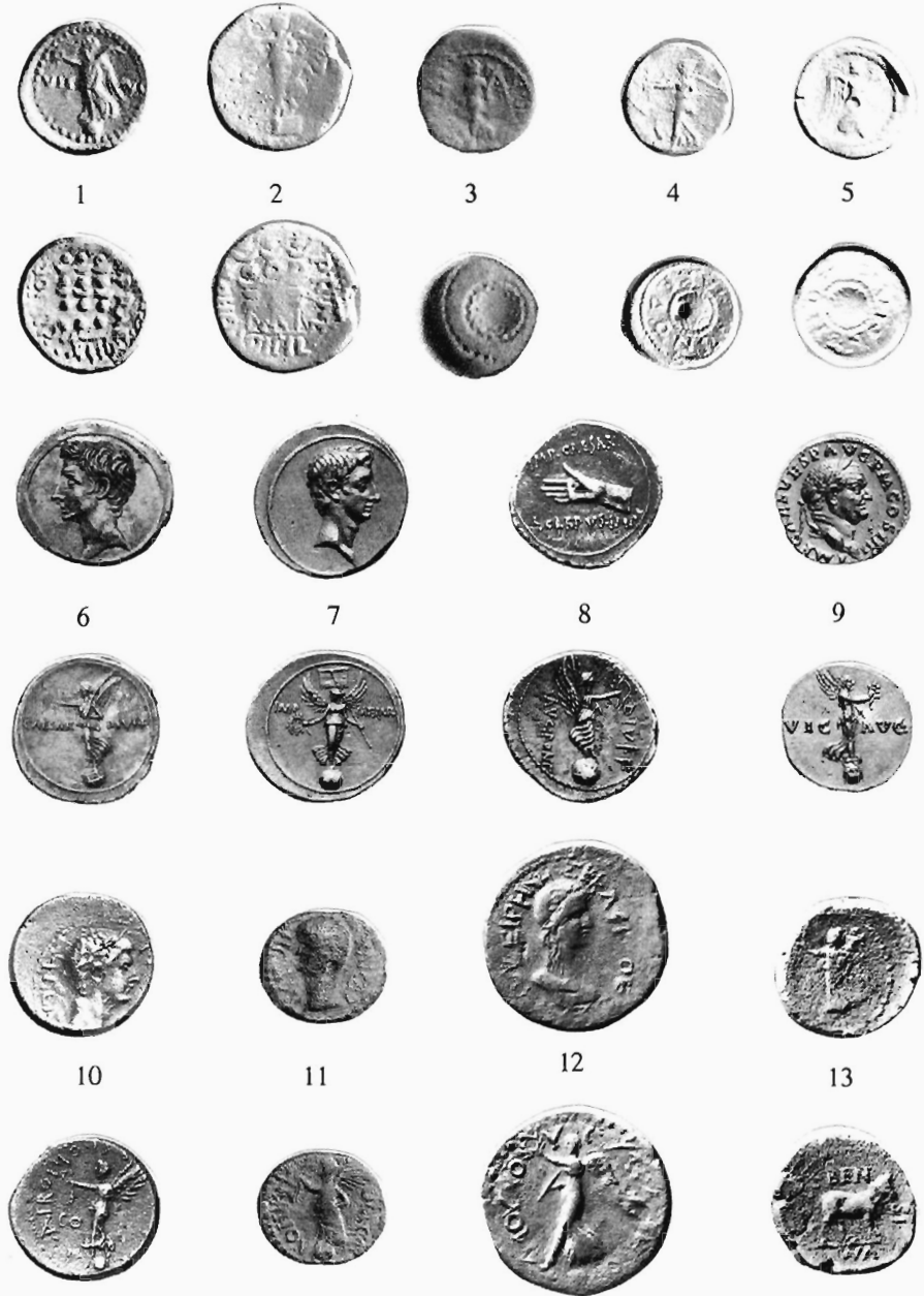
S. Kremydi-Sicilianou, Pl. 1