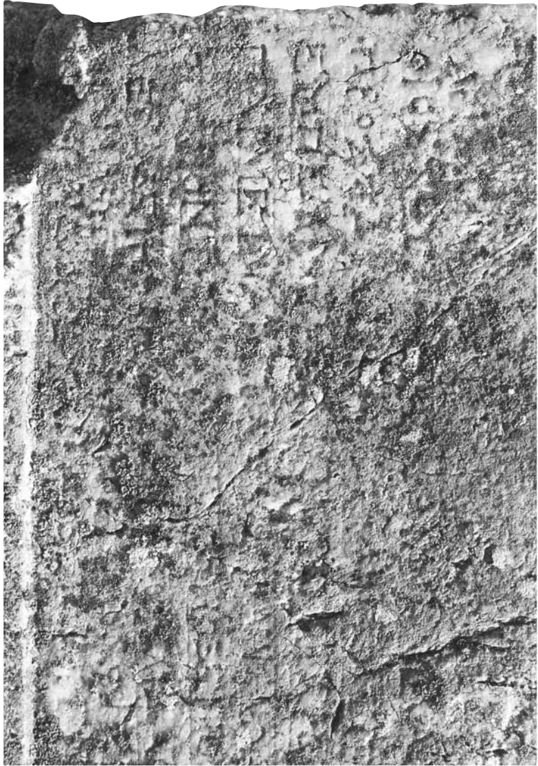
Fig. 4. New stone, front view, detail of bottom lefthand quadrant. (Photo E. Meyer).