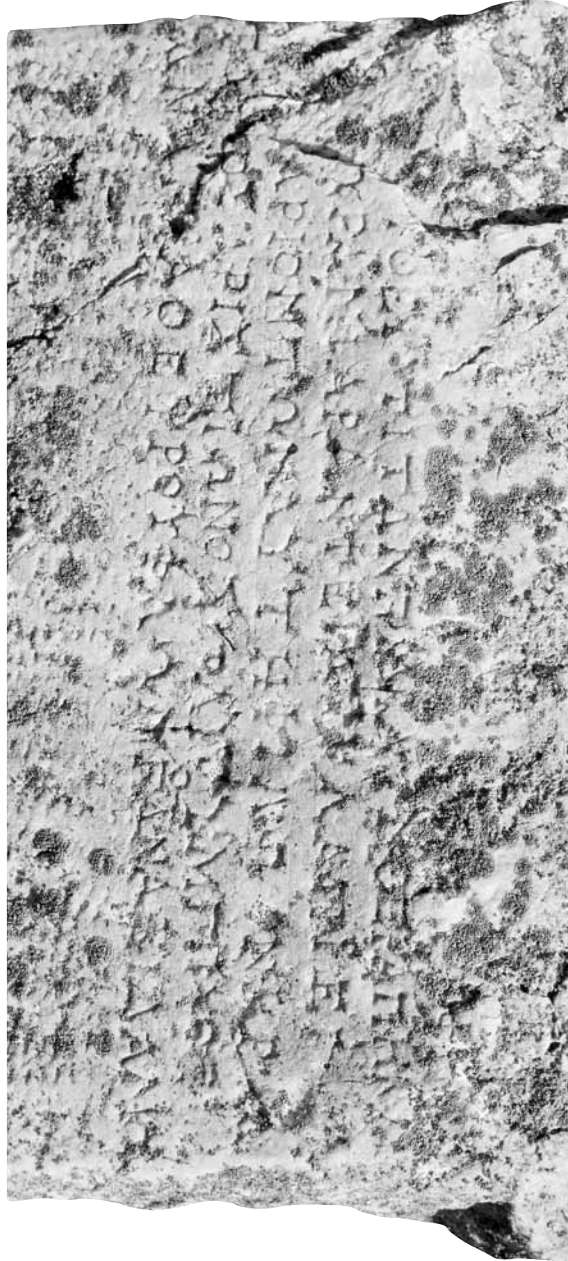
Fig. 7. New stone, right face.