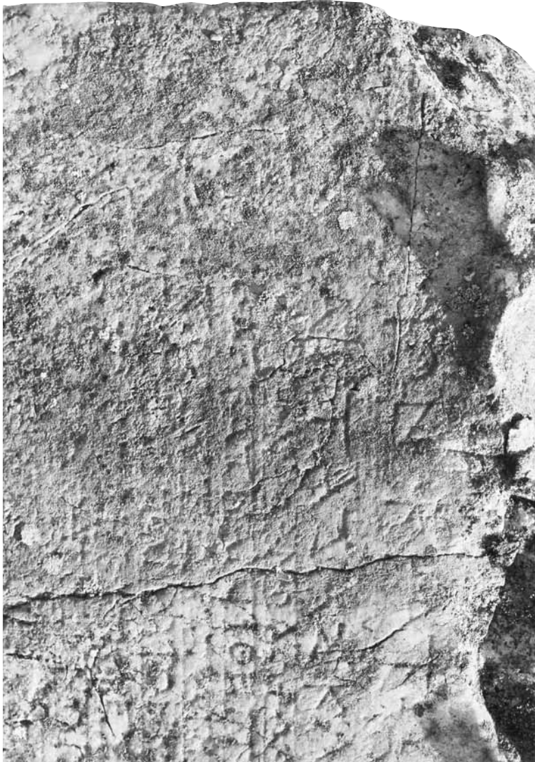
Fig. 2. New stone, front view, detail of top lefthand quadrant.