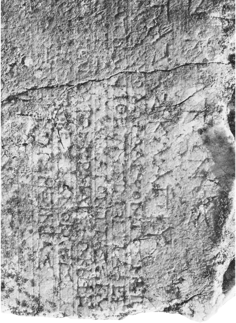
Fig. 3. New stone, front view, detail of top righthand quadrant. (Photo E. Meyer).