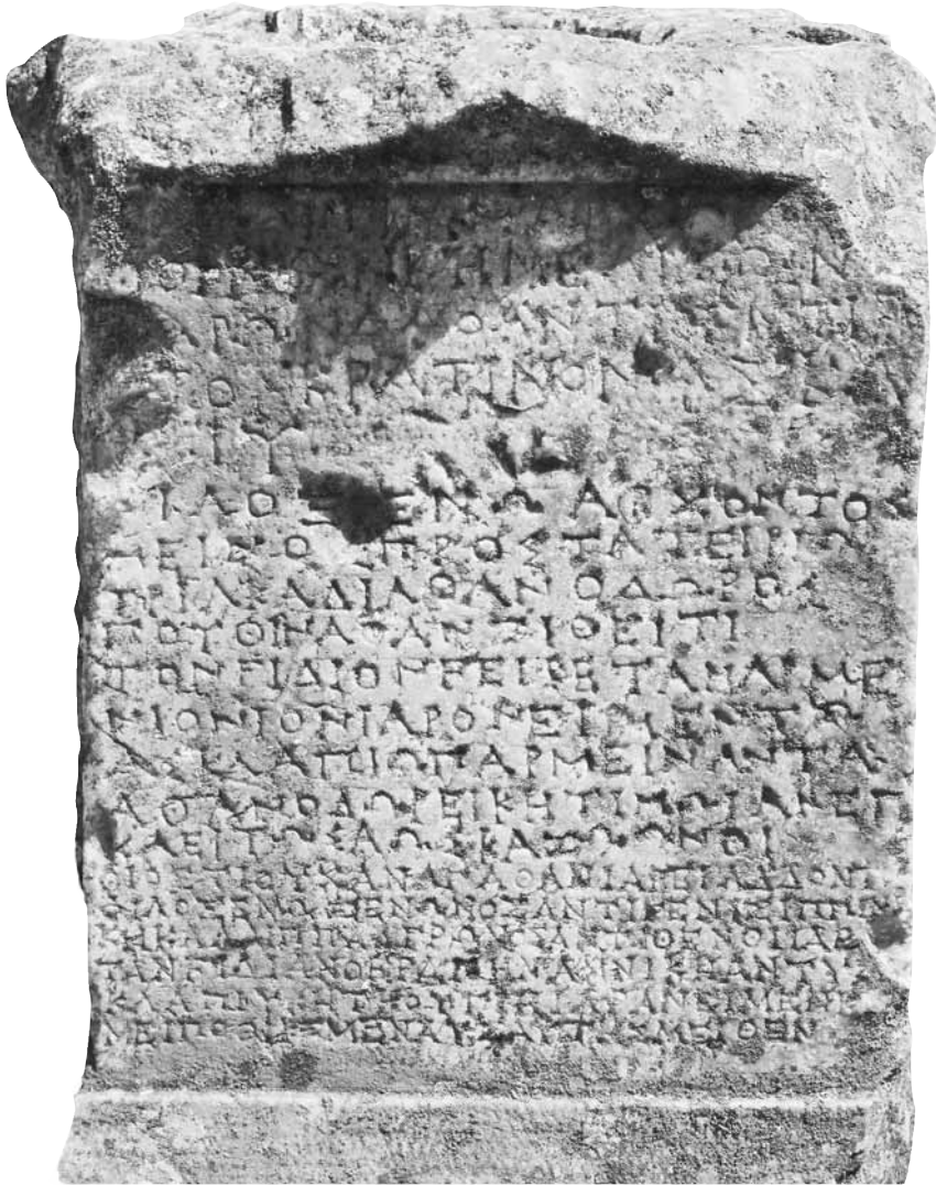
Fig. 6. New stone, left face.