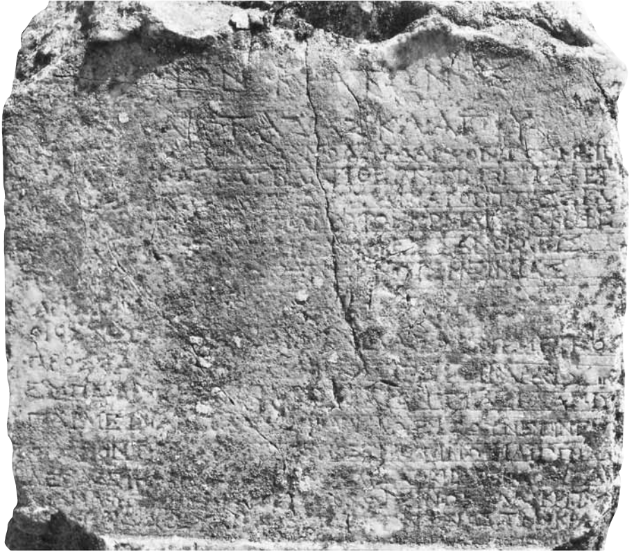
Fig. 1. New stone, front view.