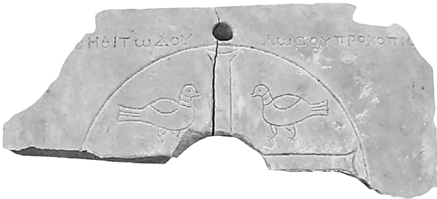
Fig. 5. Inscription no. 3 (detail).