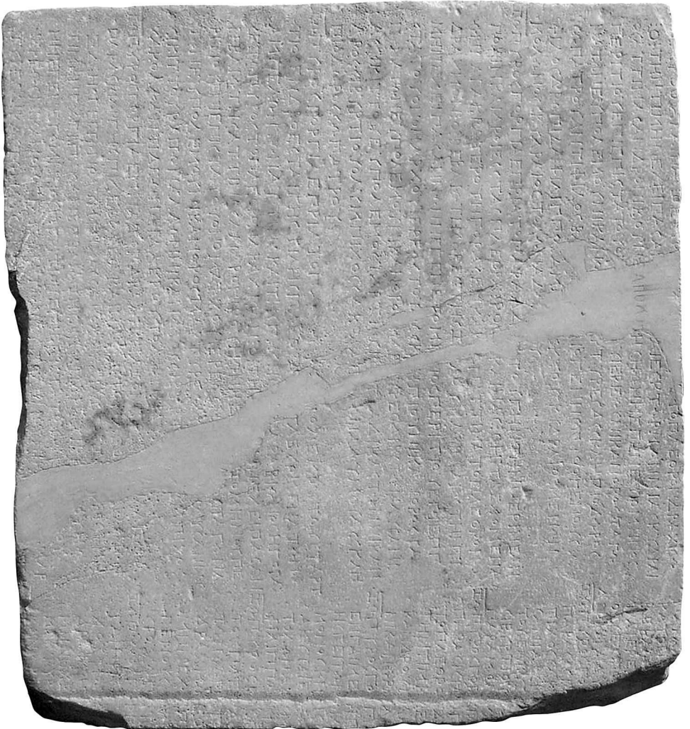
Fig. 1. The inscription; (the old and the new fragment)