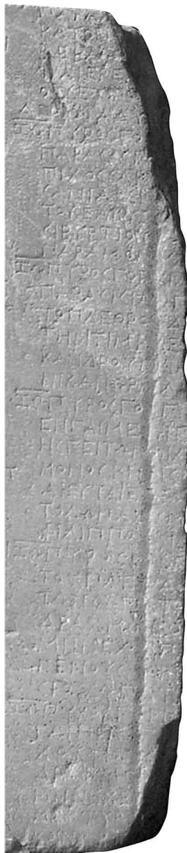
Fig. 3. The right “page” of the inscription