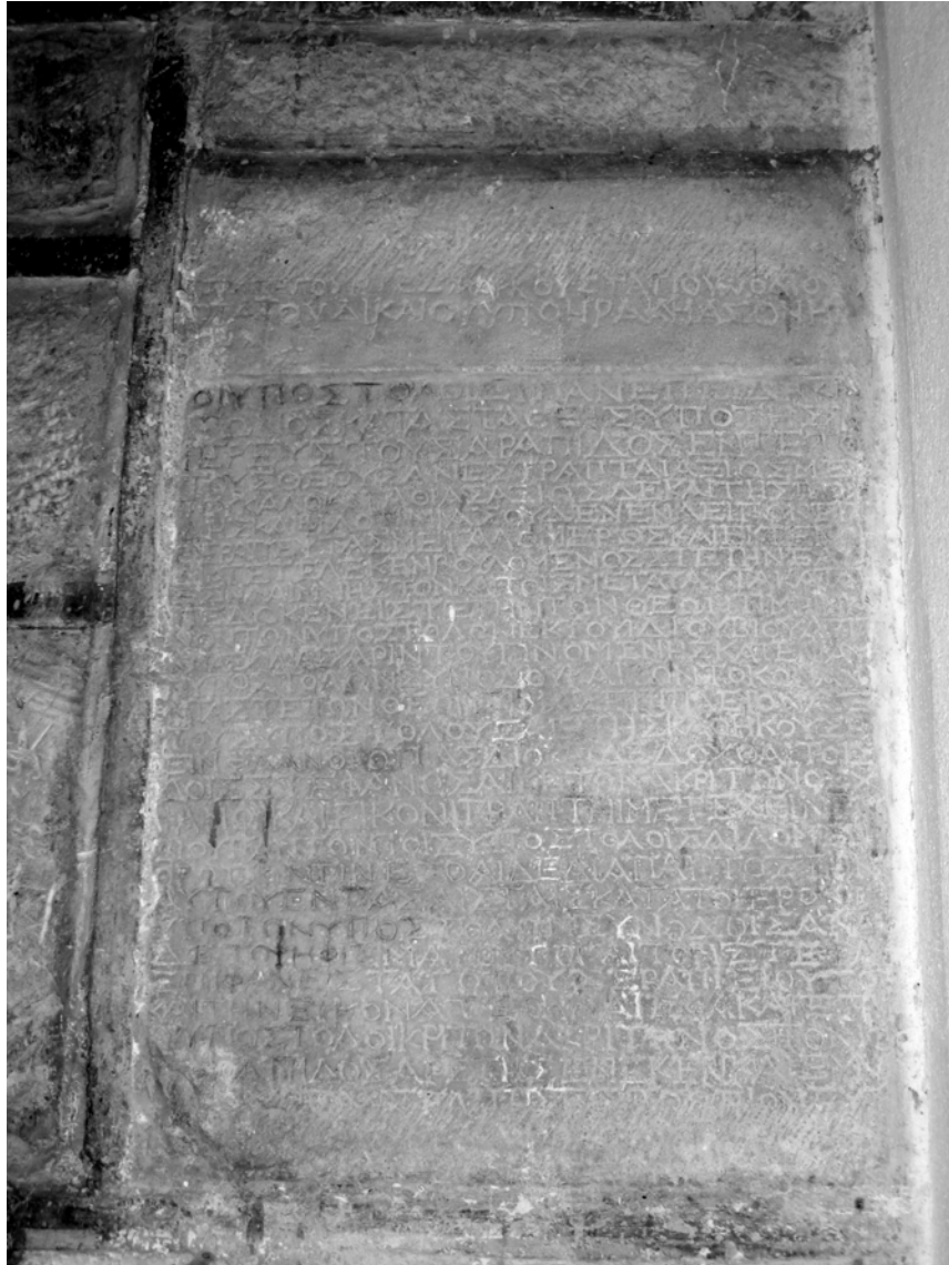
Fig. 1. The decree of the hypostoloi from Demetrias (IG IX 2, 1107b = RICIS 112/0703; c. 117 BC) in the Byzantine Church of Panagia at Makrynitsa.