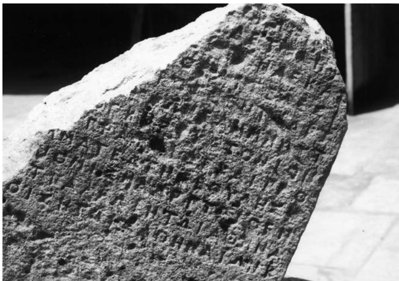
Fig. 2. Detail of its upper part.