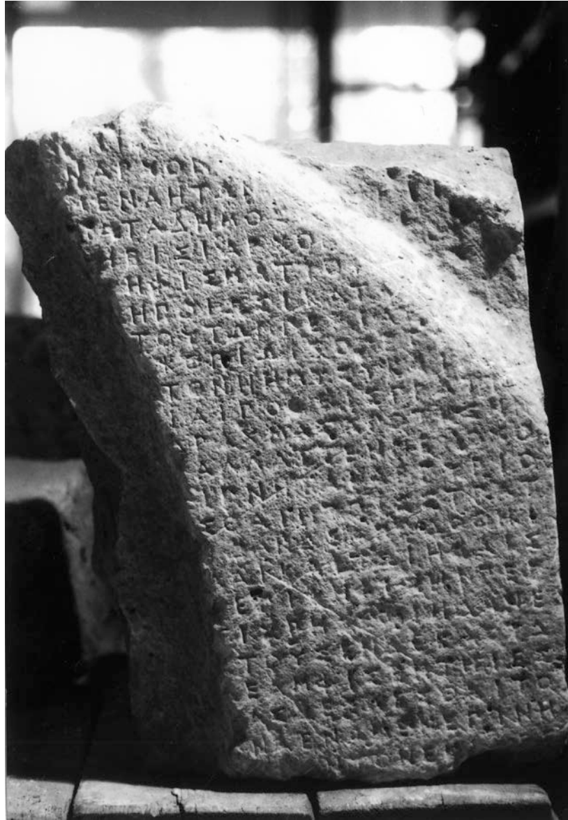
Fig. 4. The lower fragment of the Aphytis copy of the Athenian Standards Decree discovered in 1969 (Thessalonike Museum 6117).