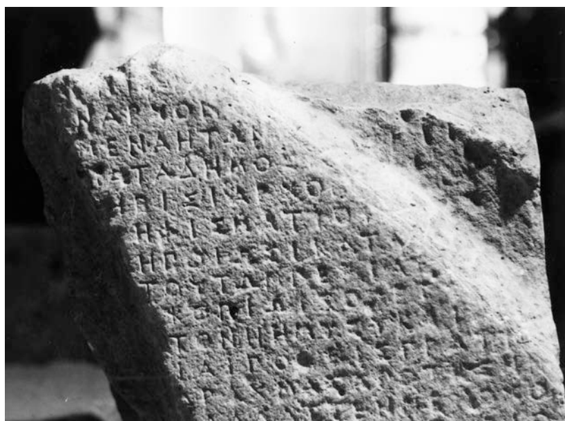
Fig. 5. Detail of its upper part.