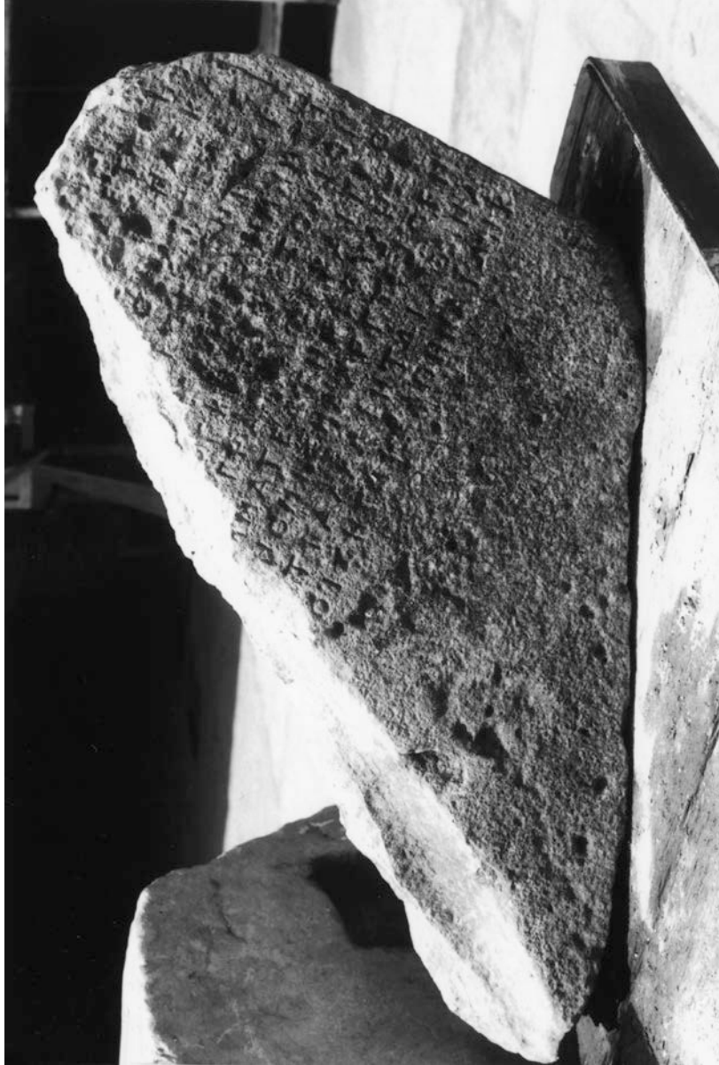
Fig. 1. The upper fragment of the Aphytis copy of the Athenian Standards Decree discovered in 1928 (Thessalonike Museum 6801).