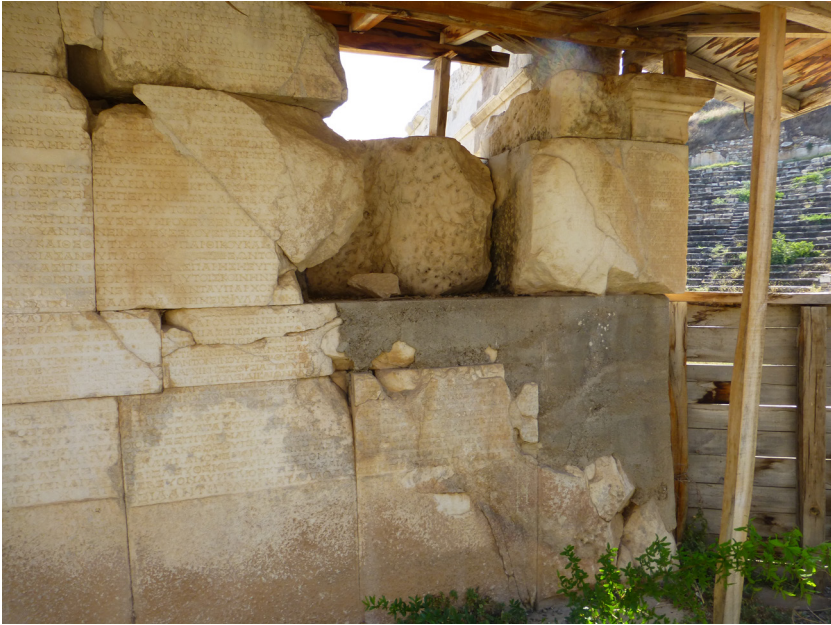
a. Columns V and VI. Column VI at right, topped by a capital at west end; north face.