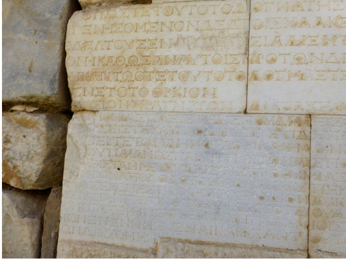
a. Column II. At top, course 8/3, document 8 (part of the surviving block with the right half of ll. 90-95 and the first line of doc. 7). Orthostate course, document 7 (part of the surviving block with the right half of ll. 2-11)