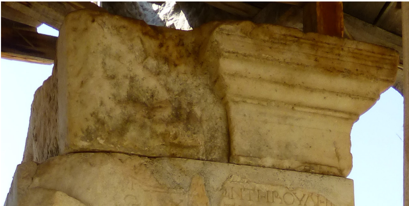
b. Column VI, course 6/1. North face of the archive wall, detail of west end, top course.