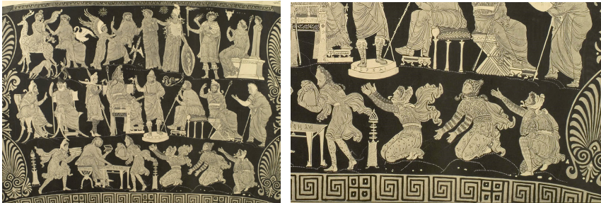
Fig. 2a-b. The "Darius Vase" (Naples 3253).