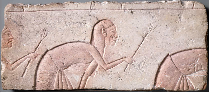
Fig. 5. Relief of bowing attendants from Amarna (The Metropolitan Museum, 1985.328.9) (public domain).