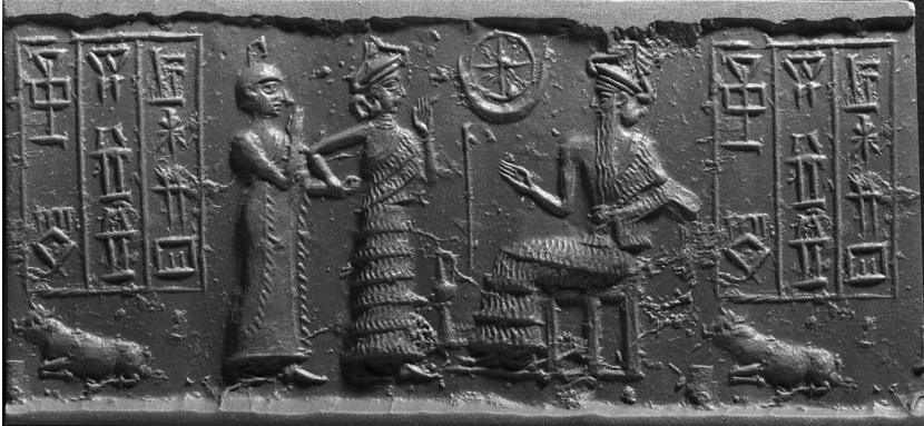
Fig. 7. Morgan seal no. 277.