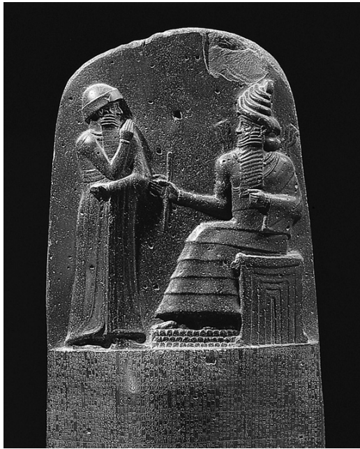
Fig. 6. The upper part of the stela of Hammurabi's code of laws (public domain).