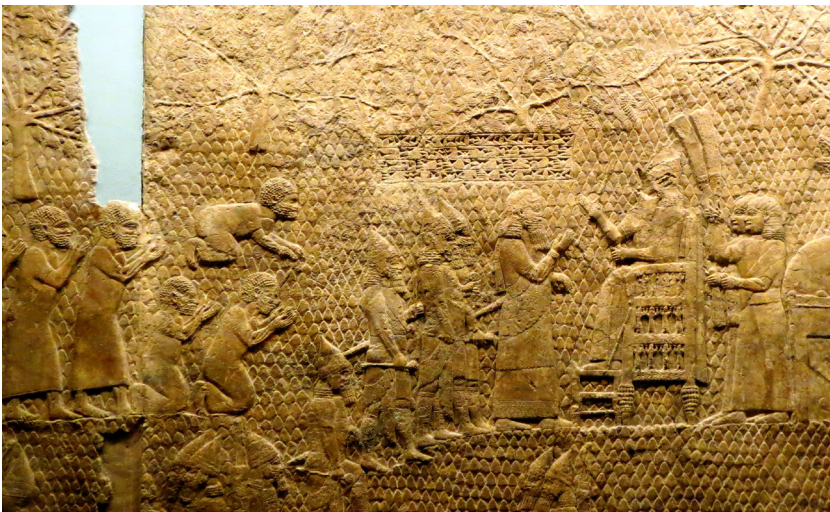
Fig. 8. The relief of the fall of Lachish.