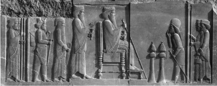
Fig. 3. Audience scene in the Treasury relief, Persepolis.