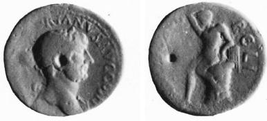
Fig. 4. AE, Pella, Hadrian (AD 117-138) (Photo: SNG Cop. Macedonia, 278).