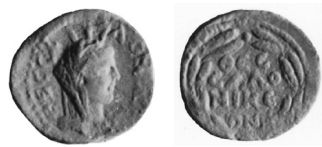
Fig. 5. AE, Thessalonike, Roman Imperial times (Photo: SNG Cop. Macedonia, 388).