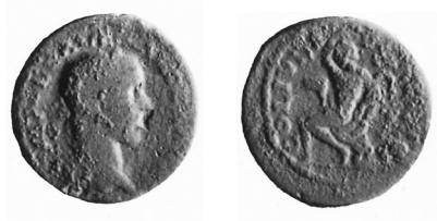
Fig. 6. AE, Pella, Severus Alexander (AD 222-235).