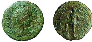
Fig. 2. AE, Pella, Roman Imperial times (3rd century AD), actual size.