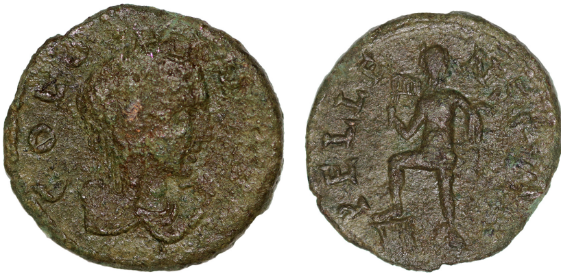
Fig. 3. AE, Pella, Roman Imperial times (3rd century AD), enlargement.