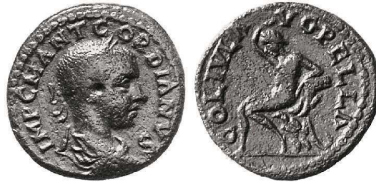
Fig. 7. AE, Pella, Gordian III (AD 238-244).