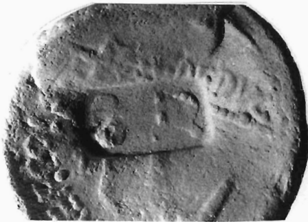
Αρ. 4 (μεγέθυνση)