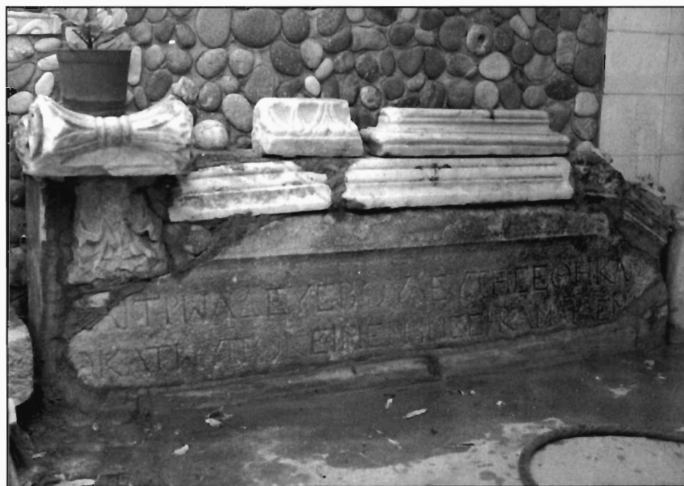
M. Riel, Plate 2