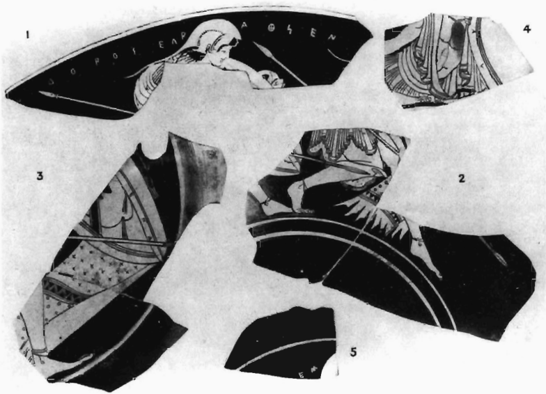
K. Görkay, Fig. 1. 1-5