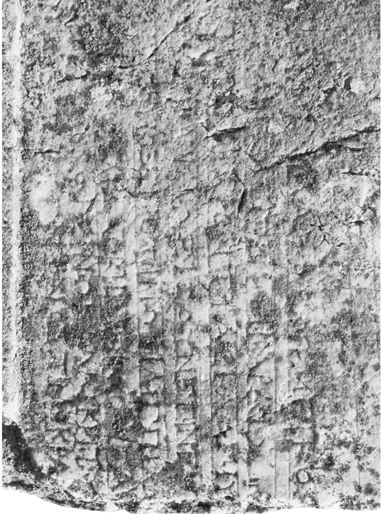
Fig. 5. New stone, front view, detail of bottom righthand quadrant. (Photo E. Meyer).